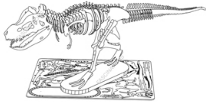
T.REX Skeleton Item No. MMS099