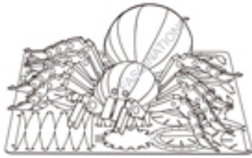
Tarantula Item No. MMS072