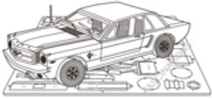
1965 Ford Mustang Coupe Item No. MMS056