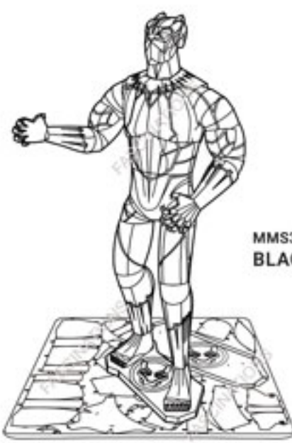
MMS325 BLACK PANTHER™